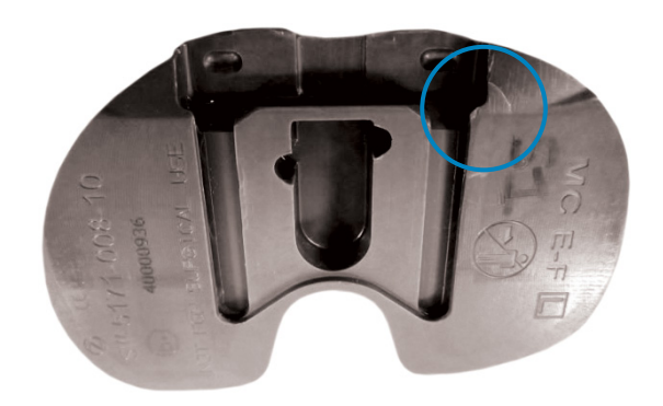
Cracks along length of dovetail