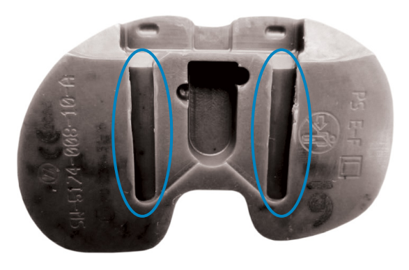
Deformation along edges of dovetail