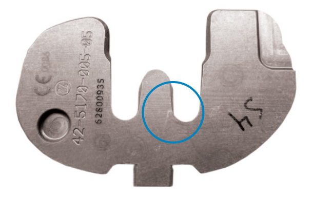
Cracks/crazing along central post